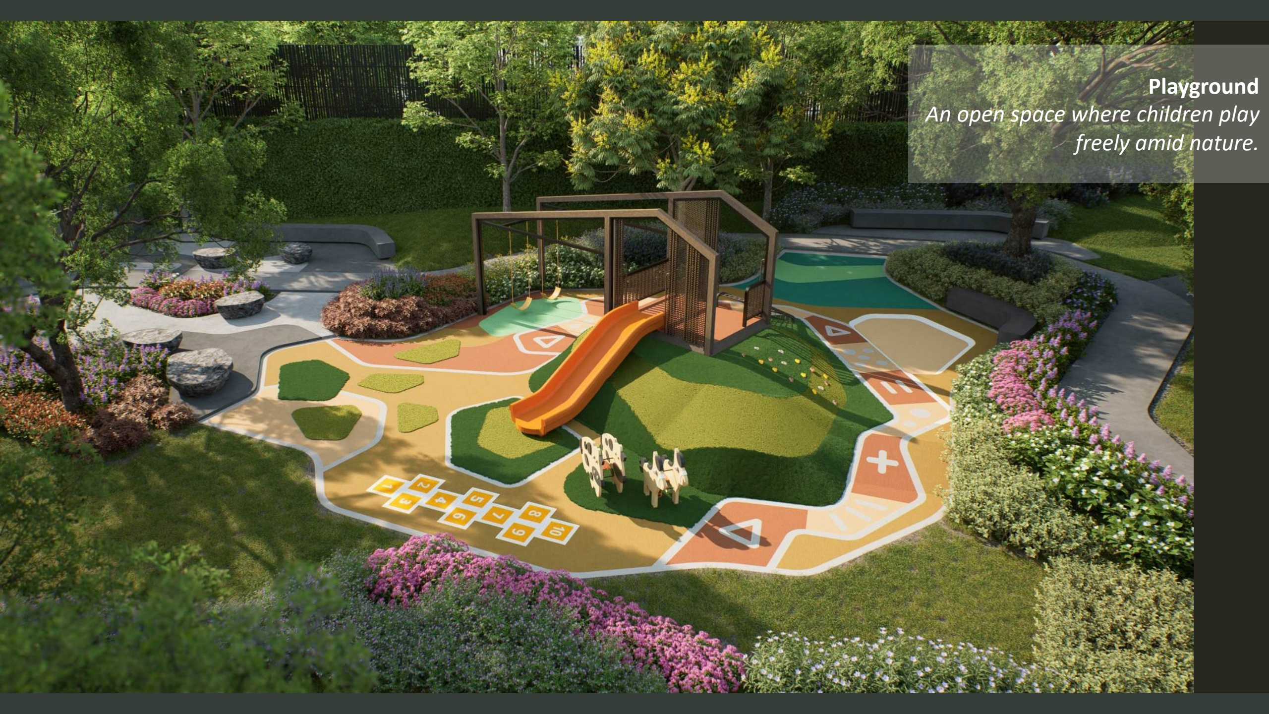
Playground An open space where children play freely amid nature.